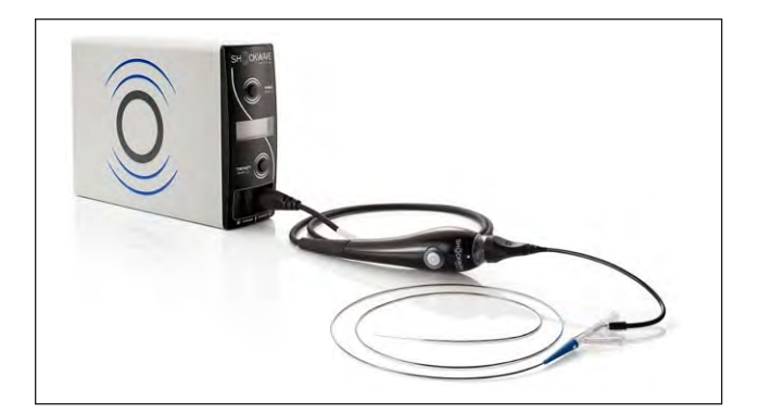
Figure 1. Peripheral intravascular lithotripsy system.

The Shockwave Peripheral IVL System is indicated for lithotripsy-enhanced, low-pressure balloon dilation of calcified, stenotic peripheral arteries in patients who are candidates for percutaneous therapy. The IVL device delivers pulsatile sonic pressure waves locally to effectively modify vascular calcium in a safe manner. The system consists of